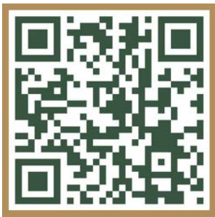
SCAN FOR A VIRTUAL TOUR